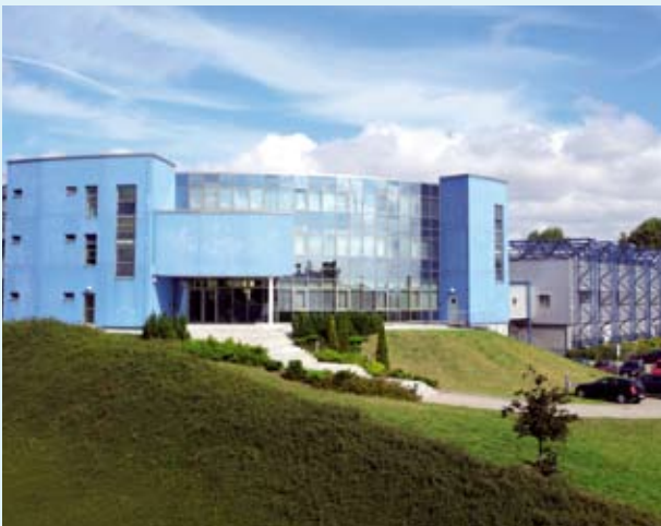
Fig. 6: Miltenyi Biotec GMP facility in Teterow, Germany