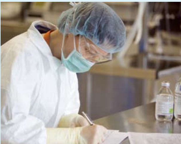
Fig. 7: Broad knowledge and skill levels among employees, ranging from technical to regulatory expertise