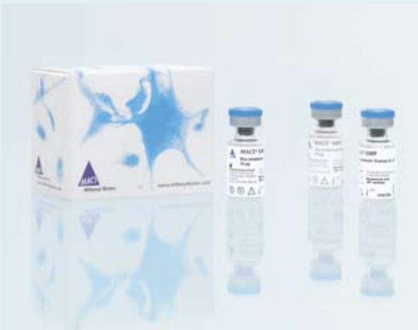
Fig. 1: MACS GMP Cytokines – quality products to meet your demands

— deliver performance, consistency, and compliance for demanding applications