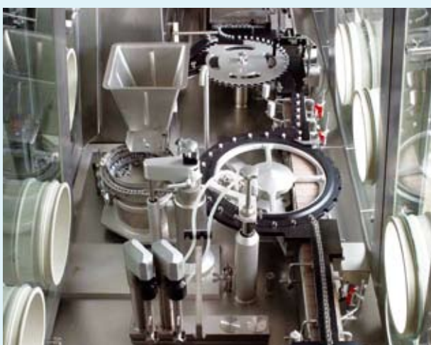
Fig. 4: Automated and aseptic filling, lyophilization, and finishing ensures product consistency and sterility

Miltenyi Biotec is committed to maintain state-of-the-art product quality standards. Controlled production procedures and comprehensive quality control tests ensure consistent product quality.