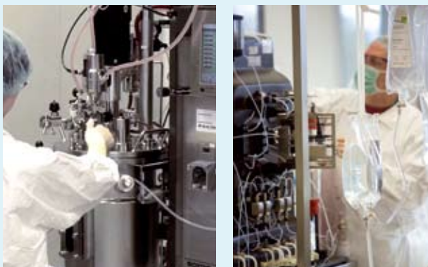
Fig. 3: Bioreactor and protein purification equipment for fermentation and downstream processing

— stringent manufacturing processes and quality control