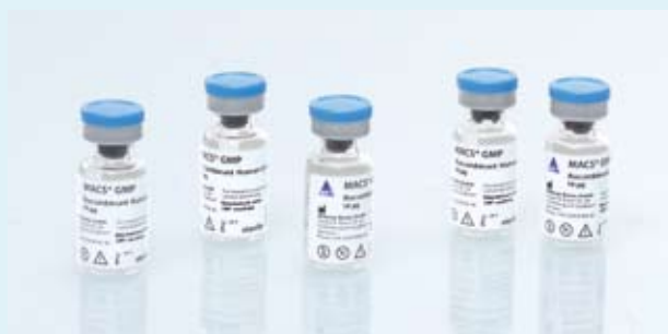
Fig. 5: MACS GMP Cytokines – assure reliability and flexibility